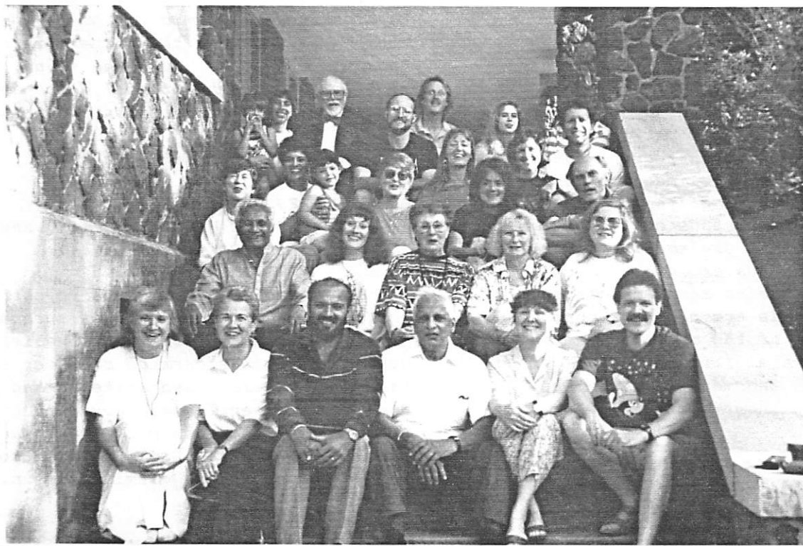
Arkansas Retreatants full of good humor and inspirations on the last day...